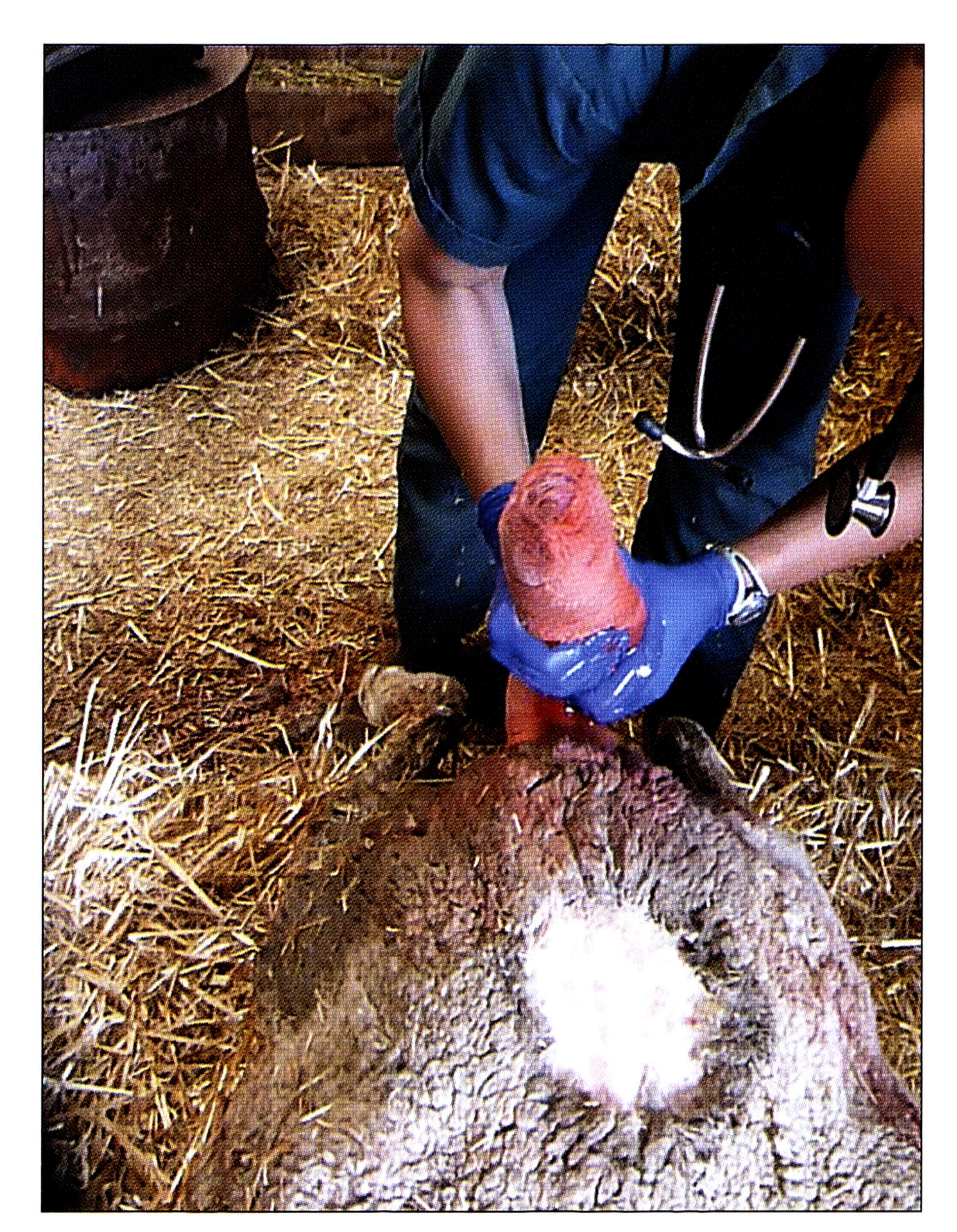
Figure 3. A prolapsed uterus in a sheep, wrapped in moistened brown gauze for manual compression and massage. Note the clipped area for placement of lumbosacral spinal anesthesia.

The course of medical management of pregnancy toxemia is dictated in large degree by the owner's priorities. Is the primary goal of case management to save the dam's life or to deliver live offspring, or both? If the primary goal is saving the dam, termination of pregnancy by cesarean section is the most expedient means of removing the primary metabolic drain imparted by the fetal glucose demand. In many cases, however, saving the offspring or the offspring and the dam is the primary goal. In such instances, unless meticulous breeding records are kept, the veterinarian is often challenged by not knowing the dam's expected due date. Typically, these cases are managed medically until parturition begins or is judged to be near. At that time, the dam's status can be assessed to determine whether induction