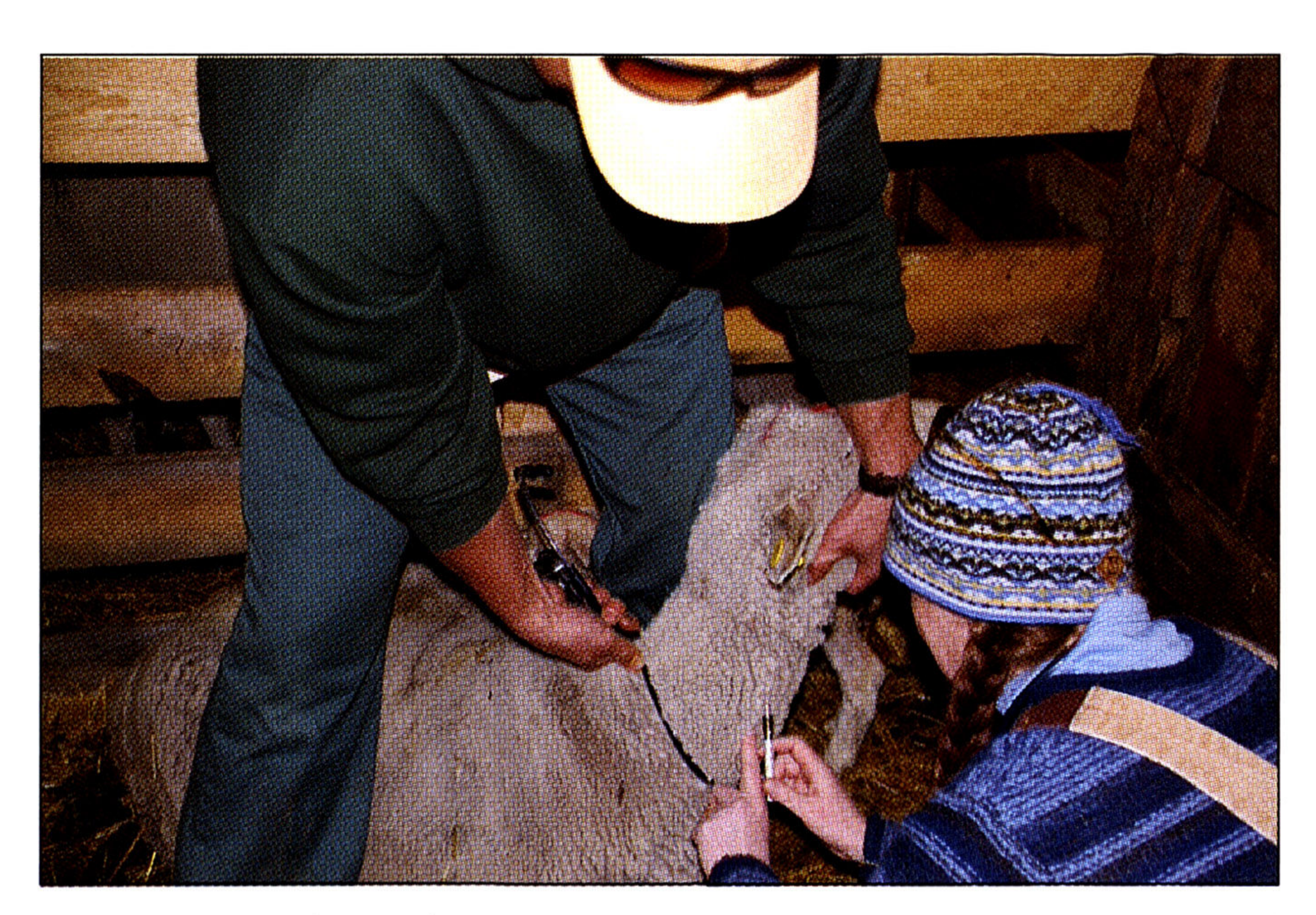
Figure 1. Use of a stethoscope as a tourniquet to induce distension of the jugular vein.

anesthesia can be induced at the lumbosacral space, as de-