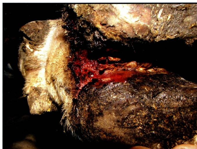
Image 1. Erosive lesion involving interdigital space and palmar aspect of right forelimb.

Routine histopathology of biopsies showed a hyperplastic epidermis with neutrophilic inflammation of the superficial epidermis and underlying dermis. On silver stain large numbers of filamentous bacteria and spirochetes were seen infiltrating the epidermis. Aerobic cultures yielded growth of non-hemolytic E. coli , alpha hemolytic Streptococcus sp., Bacillus sp. and Staphylococcus sp. These results were consistent with a diagnosis of papillomatous digital dermatitis.