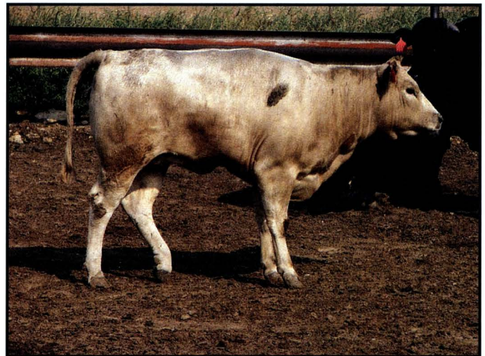
Image 3. Typical stance of cattle affected with papillomatous digital dermatitis.