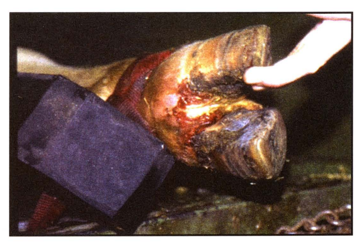
Figure 2. Interdigital necrobacillosis (foot rot). Soft tissue swelling is symmetrical relative to the axial midline of the foot.