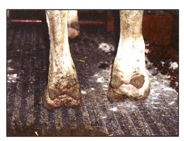
Figure 1. The gap between the dewclaws is increased in the right hind foot, indicating the presence of soft tissue swelling. The heel bulb on the lateral digit is wider than the medial digit, suggestive of the presence of deep sepsis in the lateral digit.

of the foot<sup>3</sup> (Figure 2). In contrast to footrot, deep sepsis of a digit usually results in asymmetrical swelling of the foot, with the majority of swelling located on the side of the affected digit; in other words, the affected foot is asymmetrically swollen relative to the longitudinal (axial) midline of the foot (Figure 3). As stated above, the affected foot can also be viewed from the rear, and the width of the heel bulbs compared; deep sepsis of a digit is characterized by appreciable widening of the heel on the affected side. The reason for these findings is simple: The diseased bones, joints and associated soft tissue structures are not located on the axial midline,