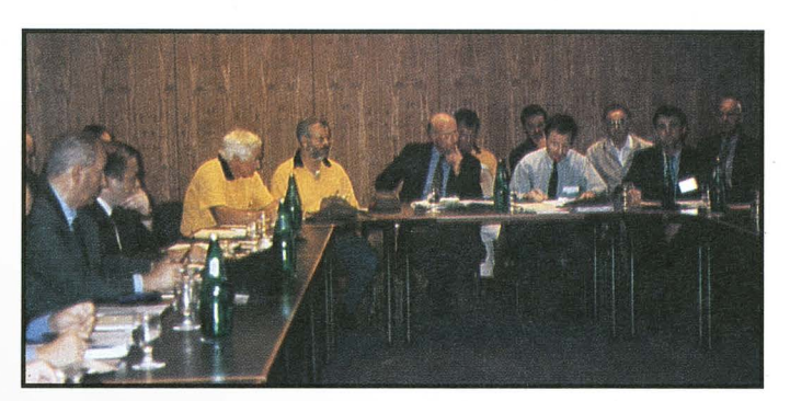
WAB Committee Meeting

The XIX World Buiatrics Congress, organized by the British Cattle Veterinary Association was held in glorious weather in the beautiful city of Edinburgh, Scotland on July 8-12, 1996 at the magnificent new Edinburgh International Conference Centre. The building was officially opened by Her Majesty, Queen Elizabeth II the previous week.