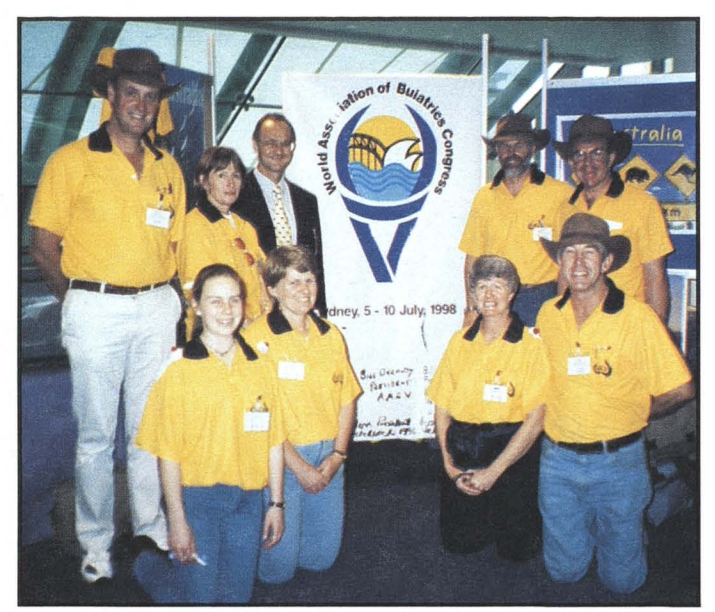
AACV representatives promoting the 1998 WAB Congress on July 5-10 in Sydney, Australia, hosted by the Australian Association of Cattle Veterinarians.