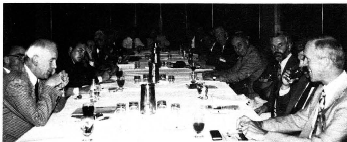
WAB Board Meeting