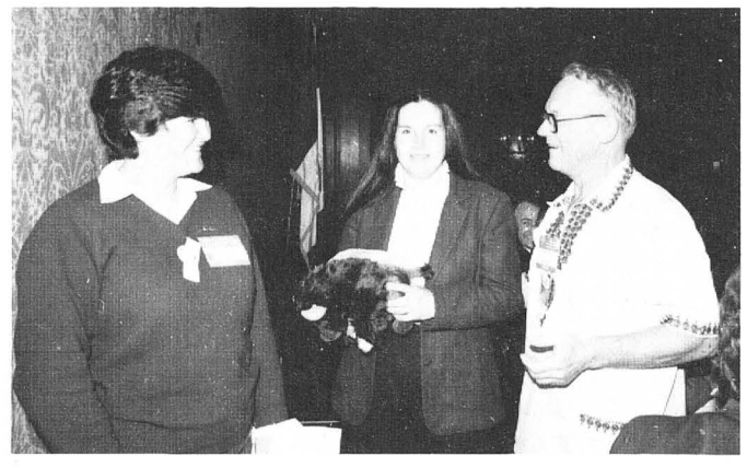
She won a buffalo?