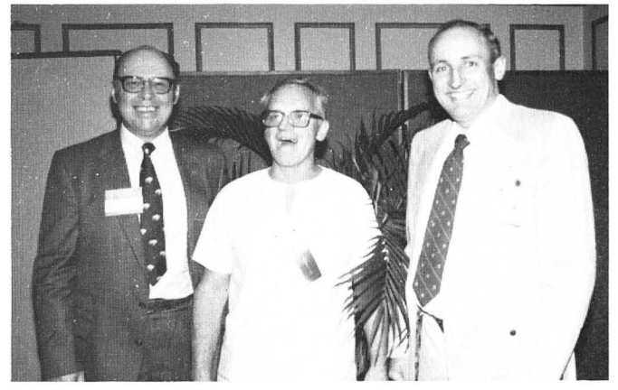
The Buffalo whiz cavaliers!