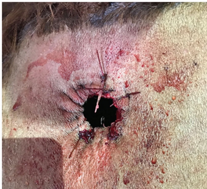
Figure 2. Completed rumenostomy site with adequately apposed rumen wall and skin using a simple continuous suture pattern.

On rare occasions the author has witnessed hysteria among animals immediately following surgery. It is hypothesized that fluid sounds and expelled steam arising from the surgical site frighten the animal. In a failed attempt to escape the unfamiliarity, panicking cattle occasionally run directly into fences or gates, sustaining severe life-threatening injuries to the cranium or spinal column.