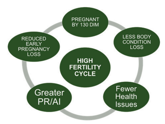
Figure 3 . The high-fertility cycle: How timely pregnancies in one lactation may lead to less BCS loss, fewer health issues, greater fertility, and reduced early pregnancy losses in the next lactation. Adapted from Middleton et al, 2019.

Based on the collective results from these studies, we can now clearly define a relationship in which herds that