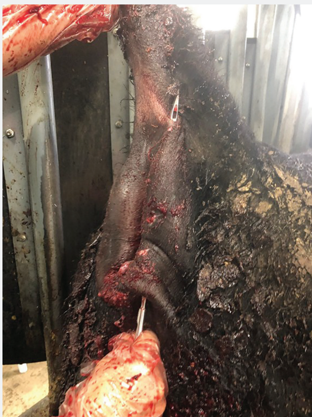
Figure 1: An assistant can thread the doubled umbilical tape through the eye of the needle, leaving at least 1.5 times the length of the vulva in the veterinarian’s left hand.