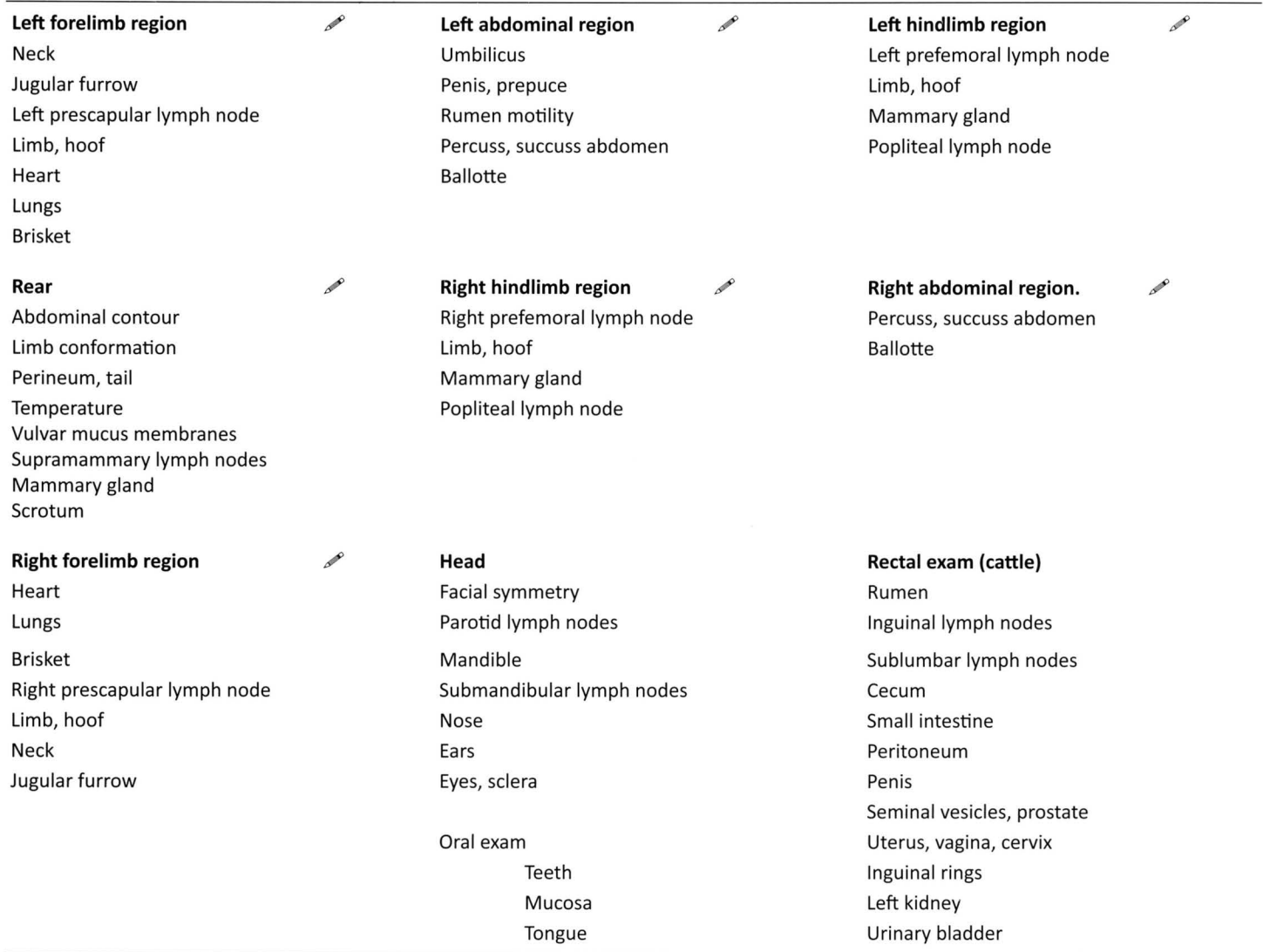
Figure 1. Regional method of physical examination of the ruminant.

nation. The importance of a thorough physical examination cannot be overstated.