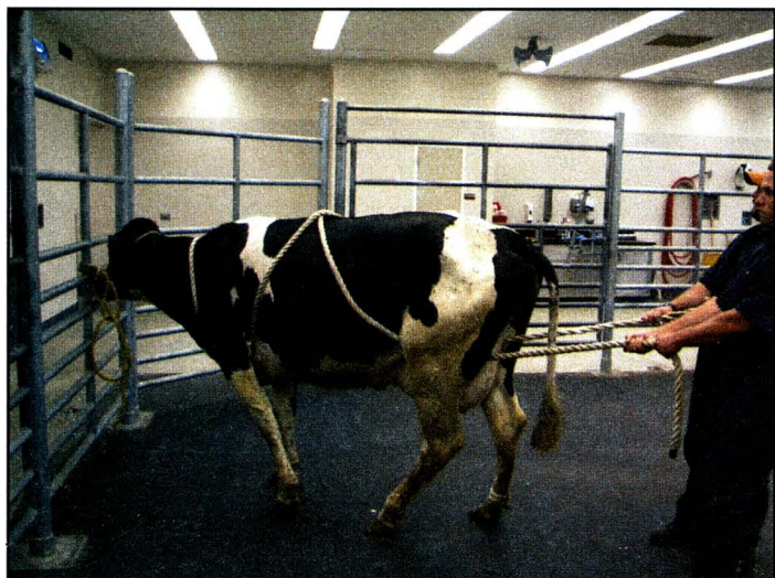
Figure 1. The “running W” method of casting and restraining a patient in recumbency. The rope is draped over the dorsal neck, through the axilla bilaterally, then crossing dorsal over the topline and finally passing through the inguinal regions bilateral.