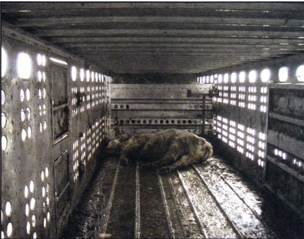
Photo 4. Wet surfaces or overloading can cause downers.

without bumping or jamming. Truck doors need to be in good working condition and raise high enough to allow the tallest animal to exit, without hitting the head or scraping the back. The use of steel grating or bars on landings and steps can help to assure smooth footing. Electrical prods and hot shots should not be used for unloading cattle. Audit guidelines for evaluating trailer unload are provided at www.grandin.com .