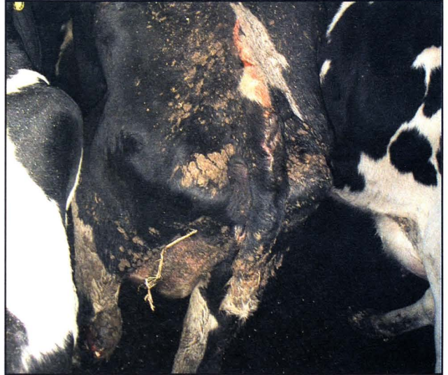
Photo 10. Transport injury from unload door.

One last measure that can greatly improve handling is the employee attitude. Providing employees