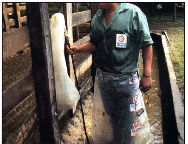
Photo 16. Stick with bag and shaker to move cattle.