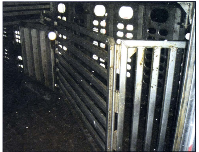
Photo 5. Truck gates used to guide cattle to exit.

Once cattle are unloaded, the animals are held in pens usually for a minimum of two to four hours and up to 24 hours. The plant is not required to provide feed unless animals will be held 24 hours or longer. It is important for water to be provided at all times (USDA and CFIA regulation). Providing ample space during holding prevents injuries and also reduces pre-slaughter