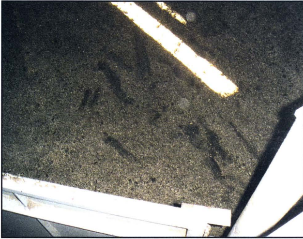
Photo 7. Worn cement results in slips on the dock.