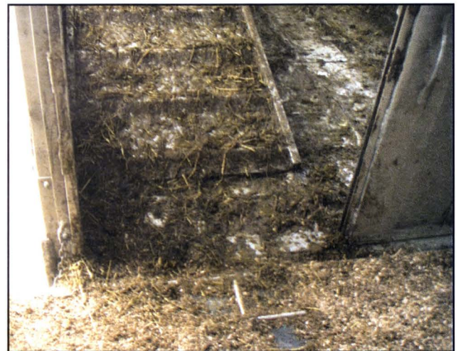
Photo 6. Steel grating on landing to improve footing.

minutes of arrival, with a maximum wait time of one hour. Truckers must take care to provide shade and ventilation in warm weather and wind protection in cold weather, during transport, stops and waiting time at the plant.