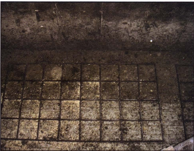
Photo 13. Hinged floor grating lifts for cleaning.