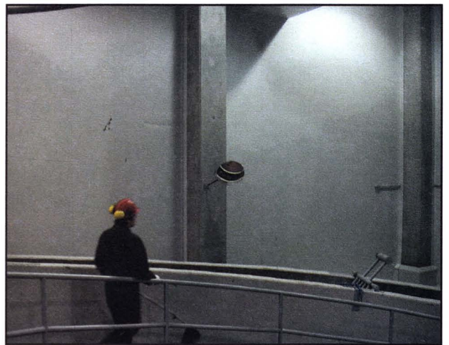
Photo 15. High walls and mirror to view cattle.

The operators responsible for driving animals to the stun box and stunning cattle need to have additional training to understand the importance of calm handling. Cattle that are agitated or prodded prior to stun can have higher levels of adrenaline, which could result in additional kicking reflexes during hanging and bleeding. This can be a safety issue for shackle and bleed operators. Agitated cattle are more difficult to stun, because