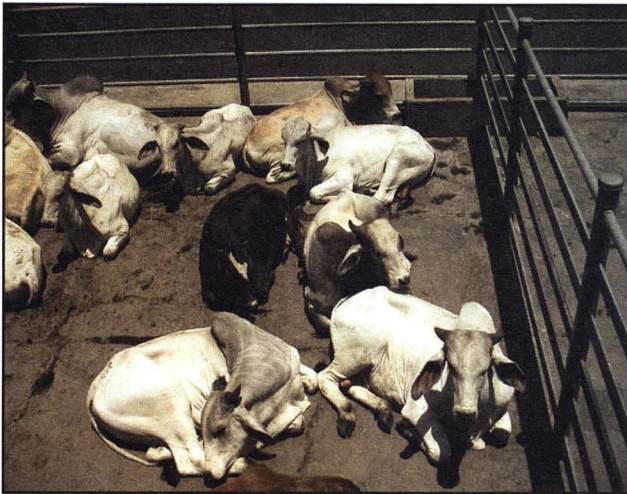
Photo 12. Holding pen with space for lying down.