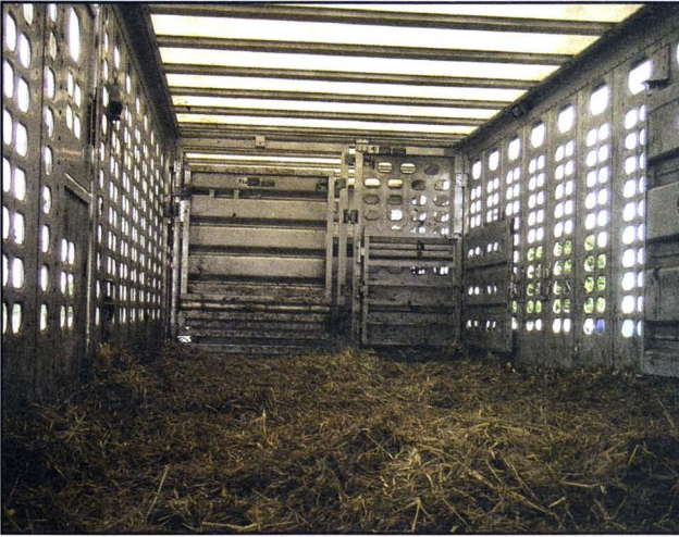
Photo 3. Straw bedding used for winter transport.