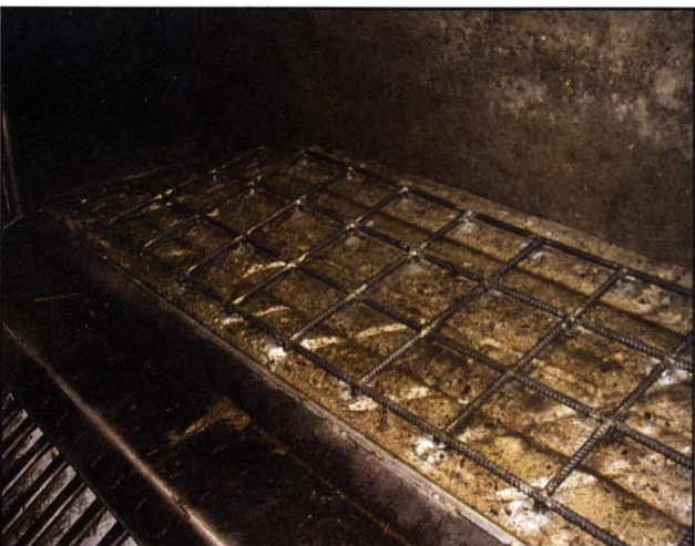
Photo 14. Welded grating on stun box floor.

with training, skills and tools will assure that the plant meets regulatory and consumer expectations for humane handling. Alternative tools such as rattle paddles, sticks with flags and canes need to be readily available, and the use of electric prods discouraged. Employees that are treated with respect will have a respect for the animals, will be more likely to handle them gently and will recognize situations that require special care or attention.