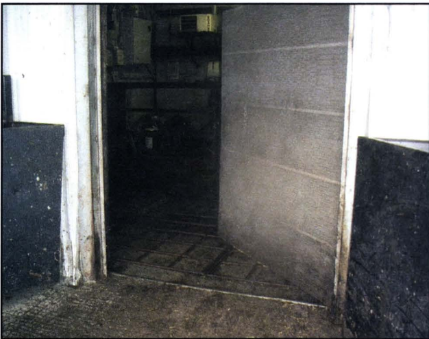
Photo 9. Door guides at plant entrance.

stress. Animals should be able to stand up, lie down to rest and reach water.