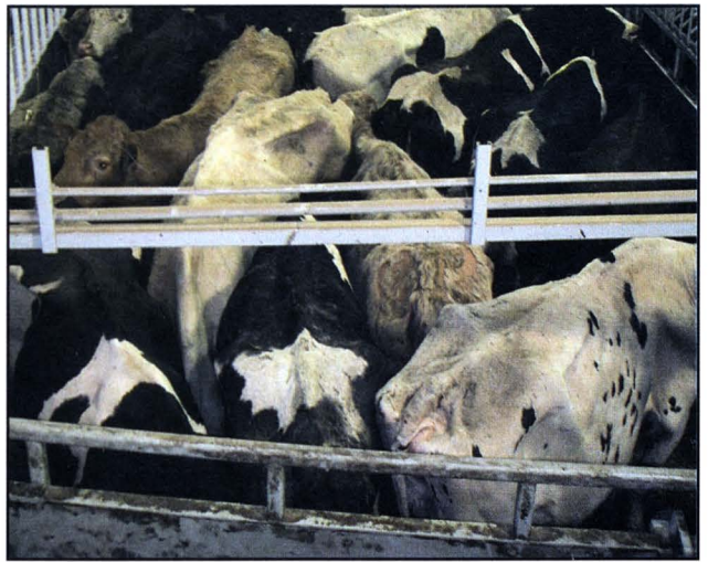
Photo 11. Harvest plant holding pen, overfull.