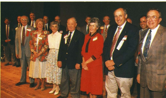
Present and past officers of the AABP