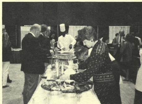
Kansas City Welcome buffet.