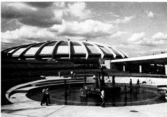
The 72,000-seat olympic stadium will eventually be overlooked by a 50-story tower supporting a parachutelike covering which can be lowered.