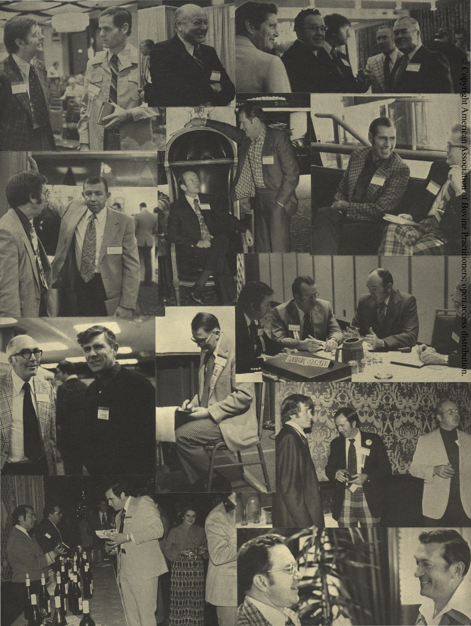
© Copyright American Association of Bovine Practitioners; open access distribution.