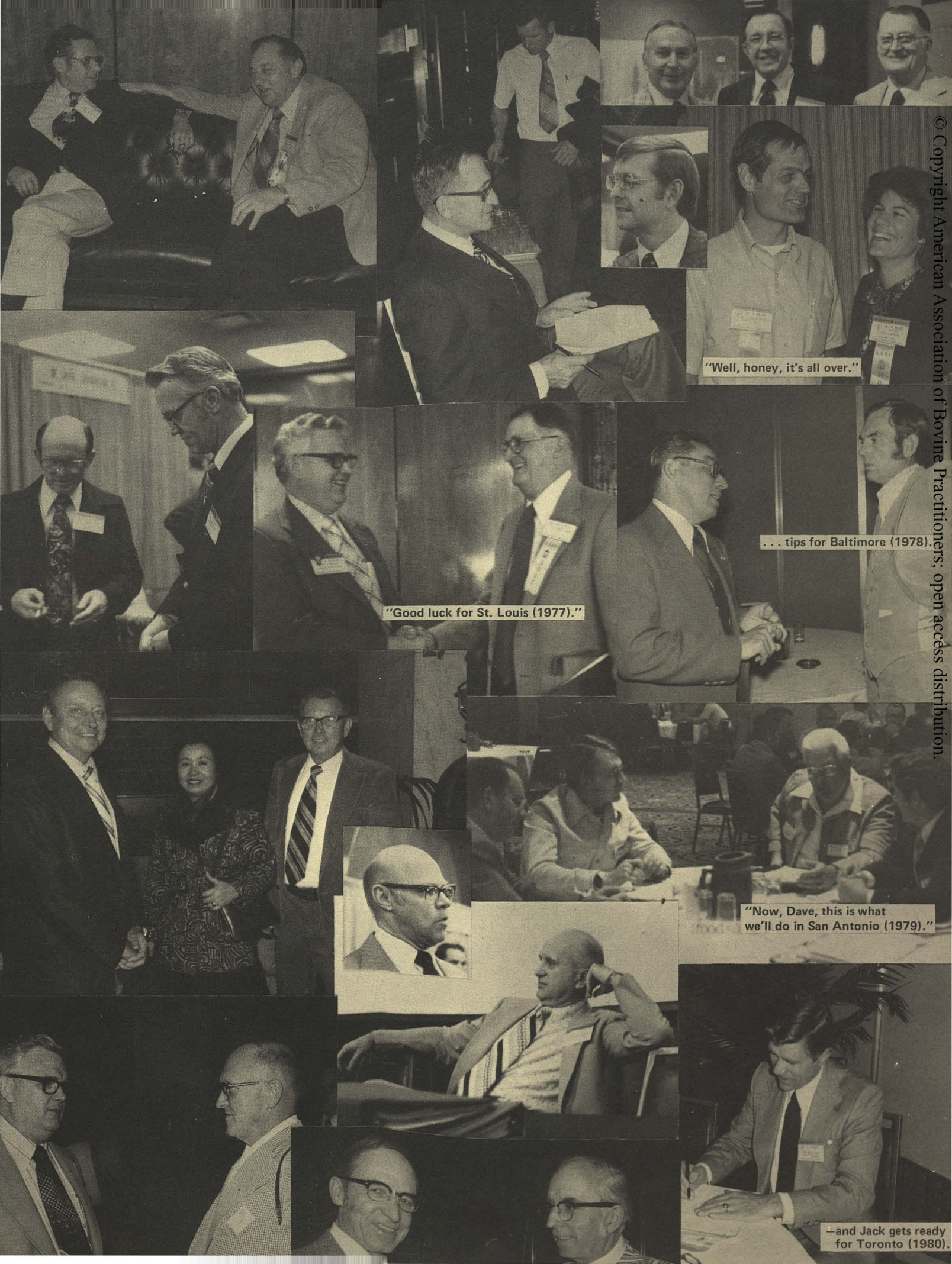
"Well, honey, it's all over."