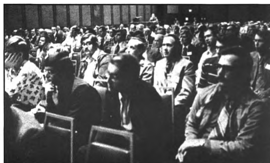
Annual General Meeting

District XIII is a newly formed District in Western Canada District V had the largest membership.