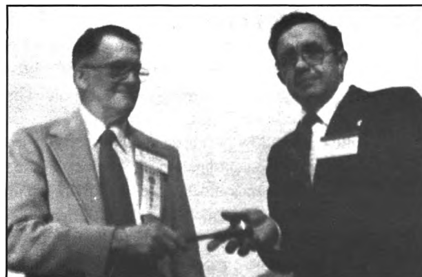
Passing the gavel