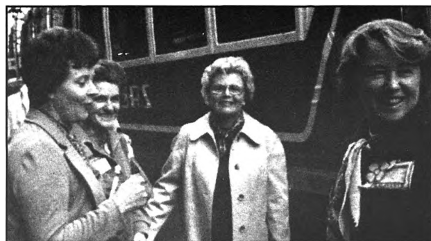
Ladies social hour