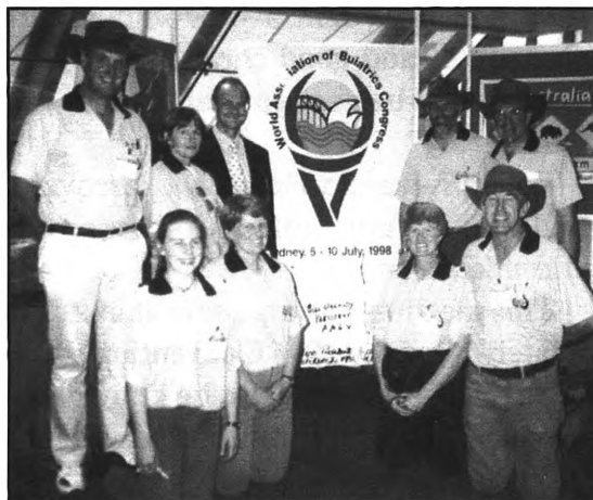
AACV representatives promoting the 1998 WAB Congress