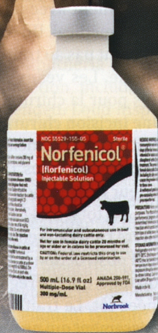
Norfenicol ® Injection (florfenicol 300 mg/mL)