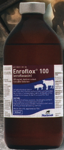
Enroflox ® 100 (enrofloxacin 100 mg/mL)