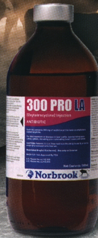
300 PRO LA ® (oxytetracycline 300 mg/mL)