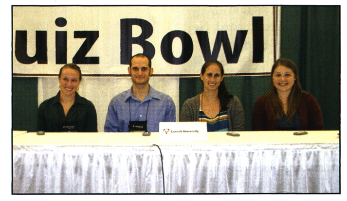
Cornell University's first place team.