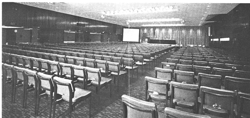
At left, the Palace Suite, in which much of the Congress will take place.

The 7th International Congress on Cattle Diseases will be held at the Royal Garden Hotel, London, England, July 31 – August 3, 1972. The Conference is sponsored by the World Association for Buiatrics and organized by the British Cattle Veterinary Association. The Congress will be opened by the Minister of Agriculture.