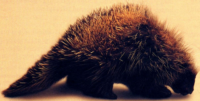
5 mL Blackleg/Somnus Vaccine