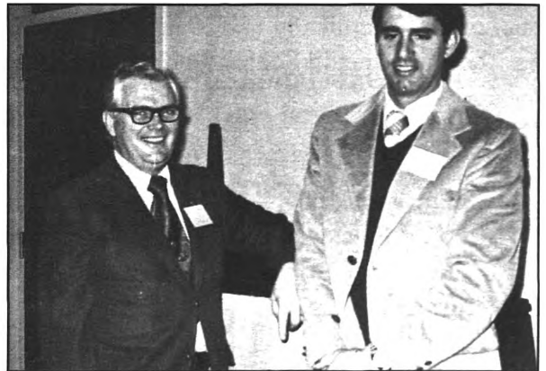
Like Father - Like Son