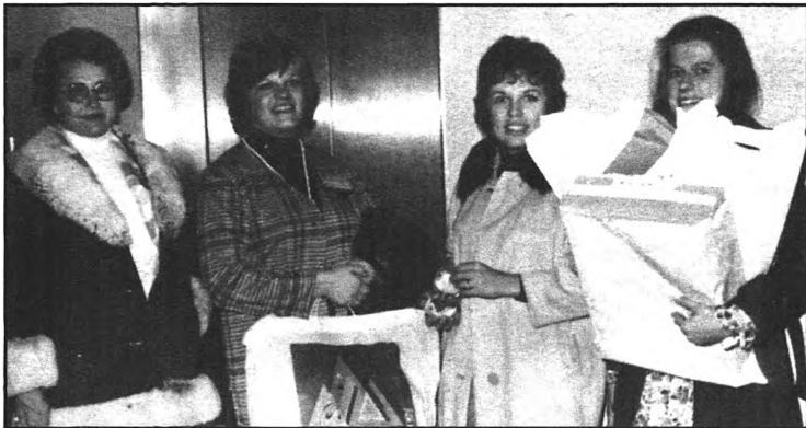
Good shopping day!