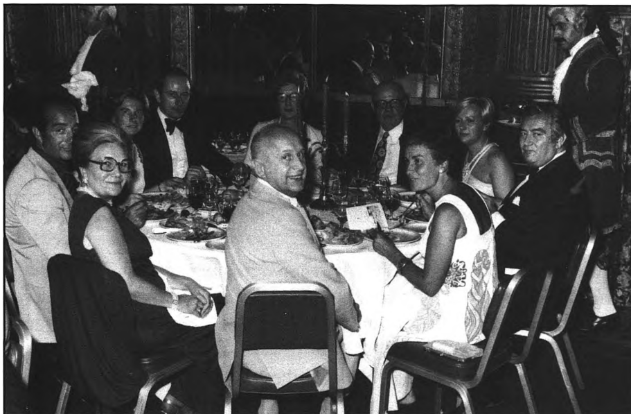
At the gala banquet