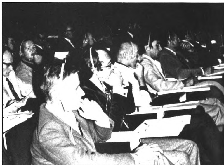
The Scientific Session