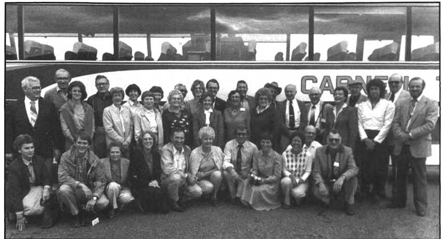
Preconvention Tour Party

“They didn’t say anything about this in the books, I thought, as the snow blew in through the gaping doorway and settled on my naked back.” Opening chapter, All Creatures Great and Small by James Herriot