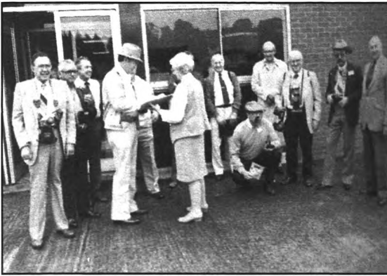
Carmarthen Veterinary Investigation Centre