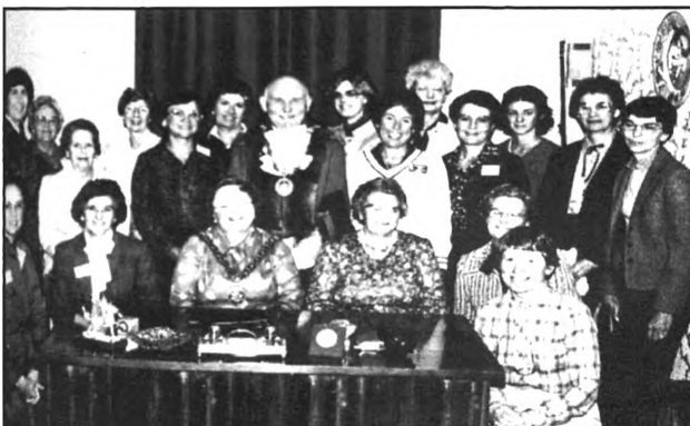
At the Mayor's Parlour