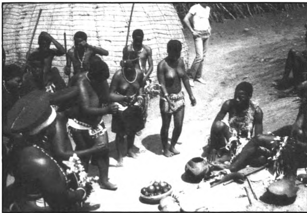
Zulus with witch doctor