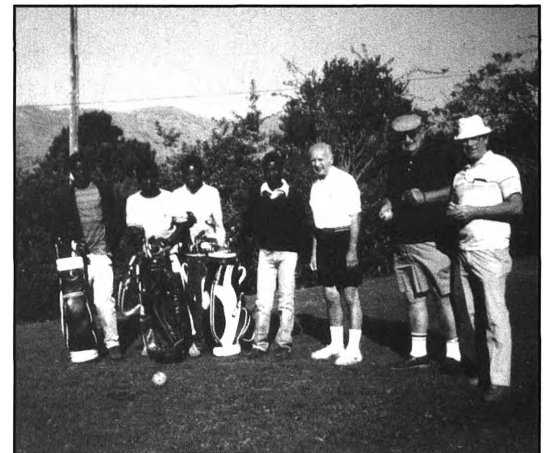
Golf at Swaziland