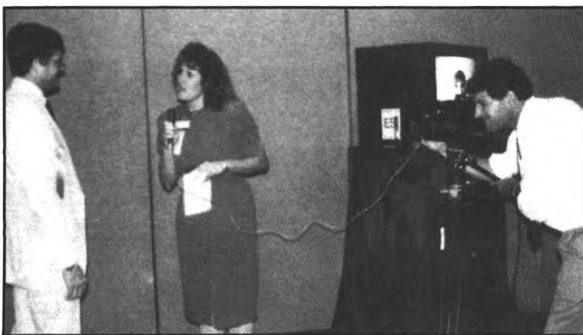
"Channel 6 Wants to Talk to You"

For more information on the Awards and recipients, please refer to the Convention Proceedings, p. xiii.