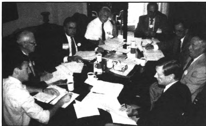
Planning Session for the 1992 Congress