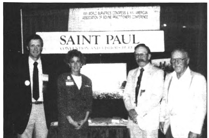
See you in St. Paul!