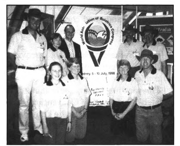
AACV representatives promoting the 1998 WAB Congress