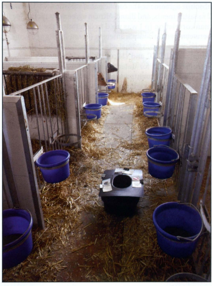
Figure 1. Calf barn air sampling assessment using Petrifilm<sup>™</sup> system. The plates (previously hydrated with 1 mL of sterile water) are exposed on a plastic surface at approximately 8 inches (20 cm) from the ground. The picture represents a sample taken at the alley level.

For Phase 1 of the study (2 farms), 5, 10, 15, and 20-min durations were tested for APC and CC to be able to select an appropriate exposure time and to avoid plate overgrowth,