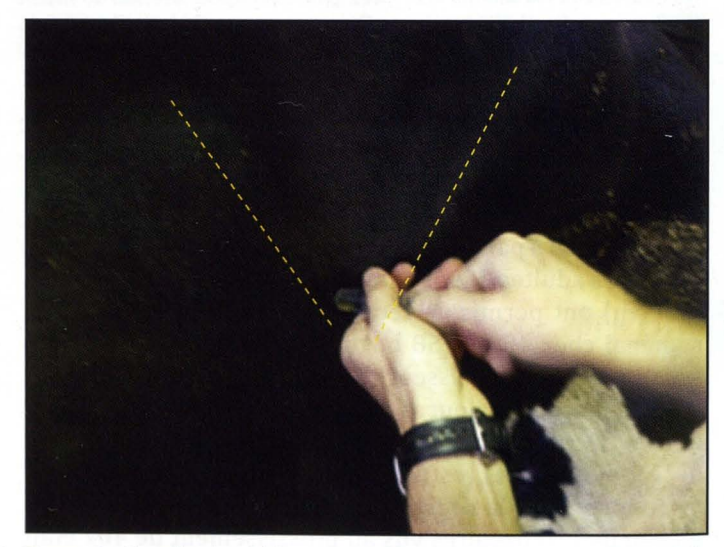
Figure 2. Needle should be inserted into the lower area of the "V". Yellow hatched line represents the "V" of the paralumbar fossa.

Simple descriptive statistics<sup>b</sup> were used for pH and rumen protozoal counts. A logistic regression model<sup>c</sup> was fit