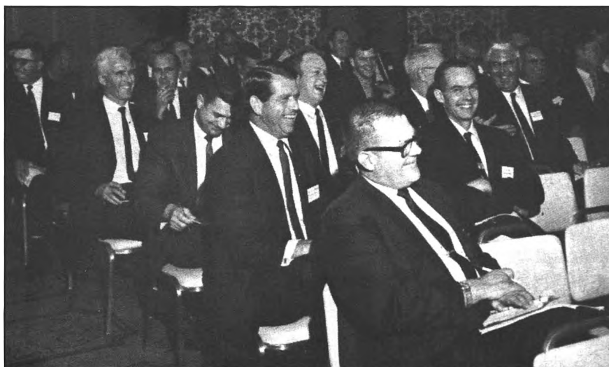
Audience had happy moments despite concentrated sessions.