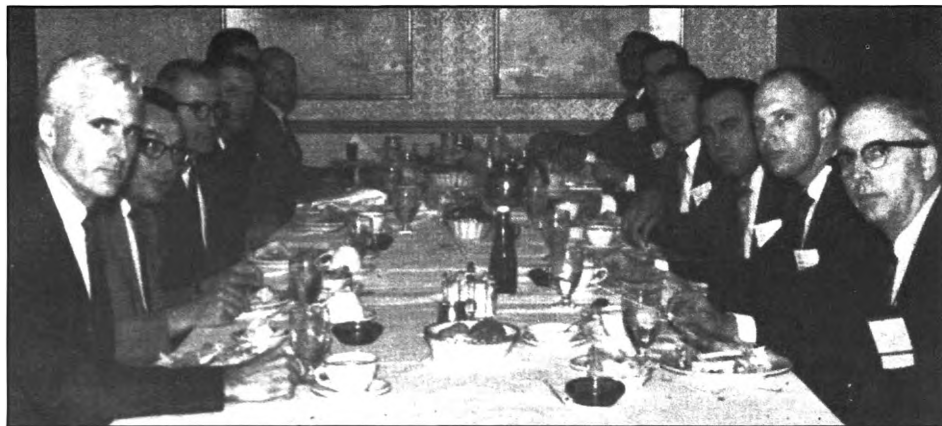
Executive Board Dinner

Editor's Note: Further information on the 1st and 2nd Annual AABP Conventions is available in J.A.V.M.A., Vol. 153, No. 3, Feb. 1, 1969 and J.A.V.M.A., Vol. 156, No. 2, Jan. 15, 1970.