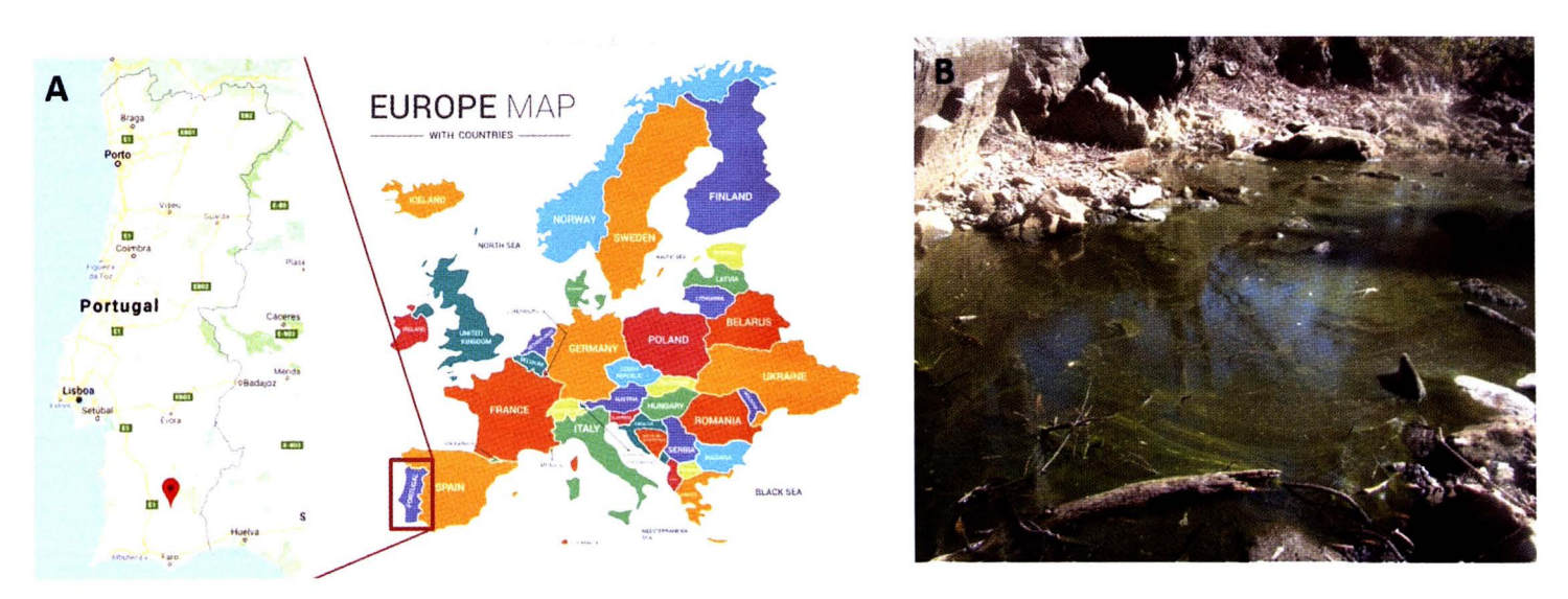
Figure 1. Cattle intoxication with cyanobacteria. A) Geographical localization; B) Oeiras Stream with a cyanobacterial bloom.

The dead animals were in good body condition and hair coats were normal. There was marked abdominal bloating, opisthotonus and soil excavation marks resulting from paddling movements in the terminal phase of the illness (Figure 2). In addition, there was blood-tinged froth and abundant blackened blood from the mouth and nostrils; the facial hair had a yellowish mud-like stain (with a sulphurous color); the eyeballs appeared sunken; and the conjunctiva and the third eyelid presented a violaceous color. There were signs of excessive lacrimation in some of the dead animals. Moreover, the animals exhibited diarrhea with darkened blood in the stools, the rectal mucosa was cyanotic with a mild prolapse, the vaginal mucosa presented a violaceous color, and the skin in the perianal region displayed punctiform hemorrhages (Figure 2). Histopathological examination of the liver revealed scattered multifocal necrosis lesions. There was diffuse tubular necrosis in the kidney, particularly severe in the cortex. Tissues and organs, ruminal content, and water were analyzed for heavy metals, specifically copper, lead, and arsenic. All heavy metal levels were within the normal range, with the exception of 1 kidney sample which had a copper level of 48 mg/kg (reference value <17 mg/kg).<sup>25</sup>