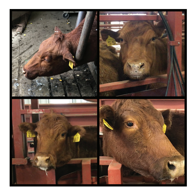
Figure 1. Beef cows with acute clinical anaplasmosis 25 to 28 days postinoculation with 55 mL of Anplasma marginale infected blood. Cows were exhibiting a grimace expression in addition to meeting clinical case criteria to be eligible for treatment.

All cows were found to have A. marginale organisms present on blood smear on the day ANA case criteria were met. Based on the results, all cows were confirmed to be positive for A. marginale at the time of treatment.